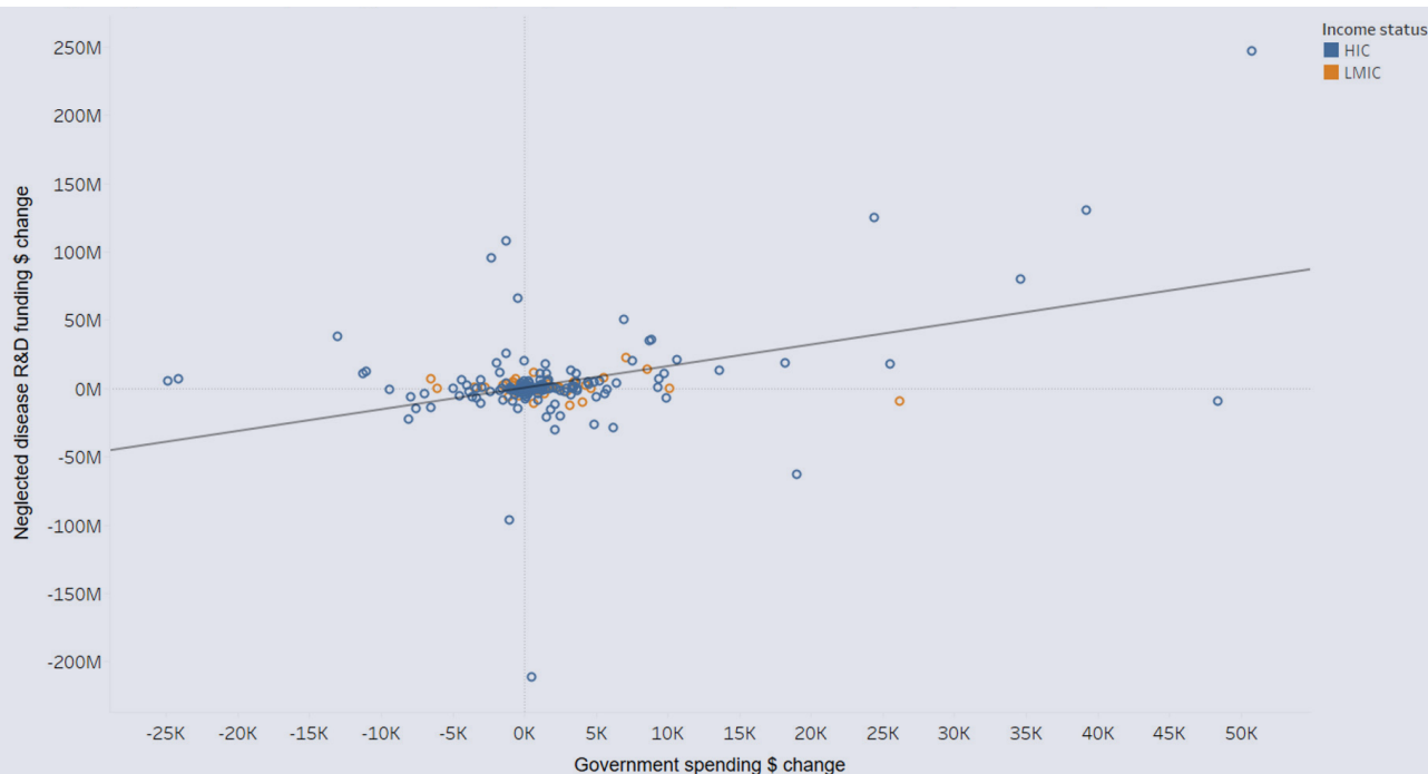
FIGURE 4. Change in neglected disease R&D funding vs change in government spending – by nation and year

This analysis showed a statistically significant relationship between changes in total spending and changes in neglected disease R&D funding, explaining about 17% of the variation in neglected disease R&D funding across our sample. Based on these results, we estimate that a $10m increase in overall government spending predicts a $1,582 increase in neglected disease R&D funding.