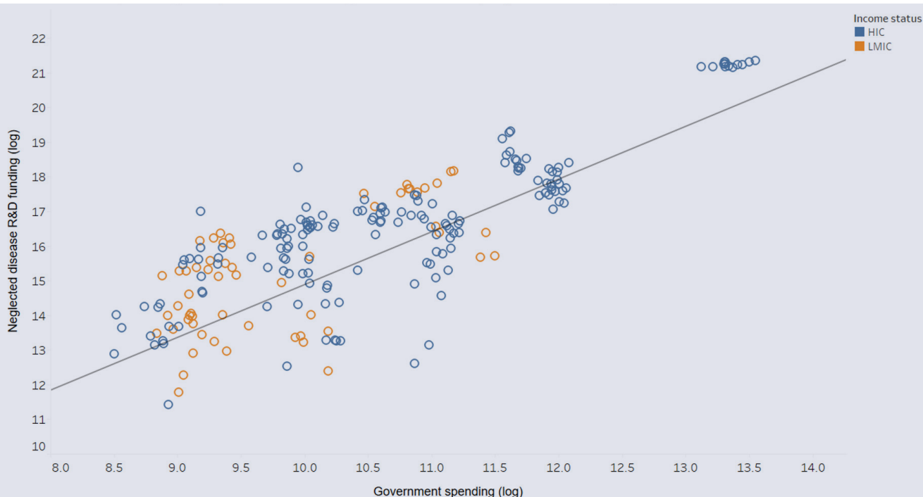
FIGURE 1. Neglected disease R&D funding vs overall government spending – by nation and year (log scale)

It shows a strong positive relationship between government spending in a given year (on the horizontal axis) and the amount of neglected disease R&D funding provided by that nation (on the vertical axis), with the overall relationship estimated by the upward trend line and a clear positive trend for both HICs (in blue) and LMICs (in orange).